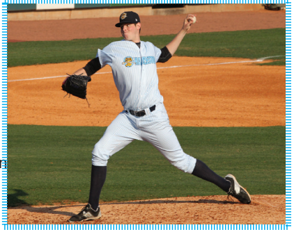
The Sumter, SC native heads to the High-A Tampa Yankees for the first time in his career